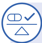
Focal and generalised seizures